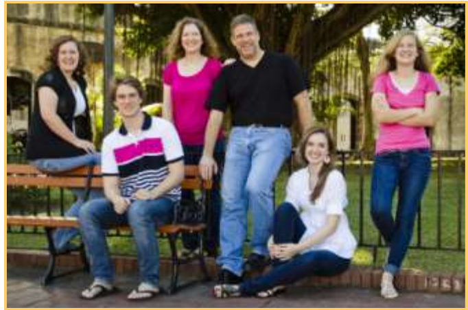
All material © 2012 by Kirk A. Jones

% AGWM, Acct. # 2254795 1445 Boonville Springfield, MO 65802-1894