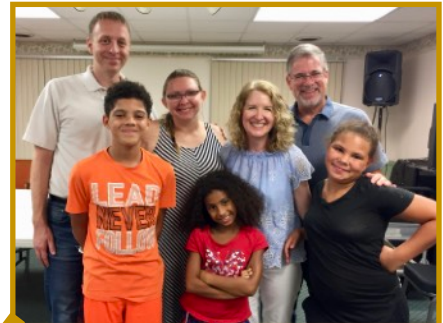
Orlando, FL, General Council, Latin America & Caribbean Experience exhibit.

The church and pastoral family are reflecting and impacting their community