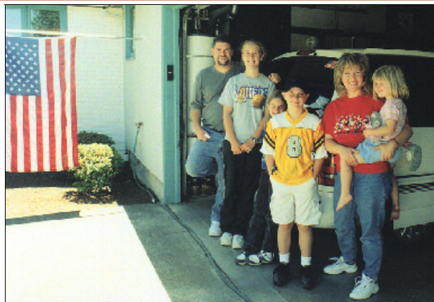
Family rallying around the flag which represents liberty & the car which represents captivity for hours at a time!

We have many dates available to schedule September - December 2002, as you might expect. If we can share at your church or group, please feel free to contact us. If not, please consider taking our pledge request before the