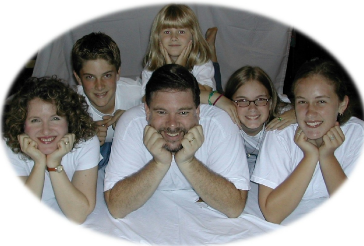
All material © 2005 by Kirk A. Jones

% AGWM, Acct # 2254795 1445 Boonville Springfield, MO 65802-1894