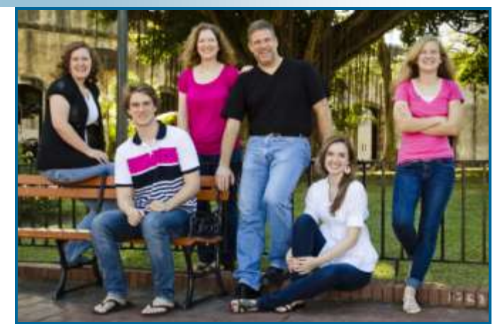
All material © 2013 by Kirk A. Jones

% AGWM, Acct. # 2254795 1445 Boonville Springfield, MO 65802-1894