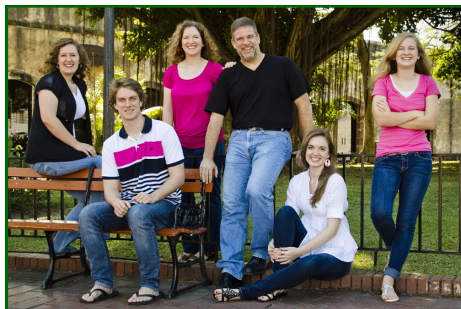
All material © 2013 by Kirk A. Jones

% AGWM, Acct. # 2254795 1445 Boonville Springfield, MO 65802-1894